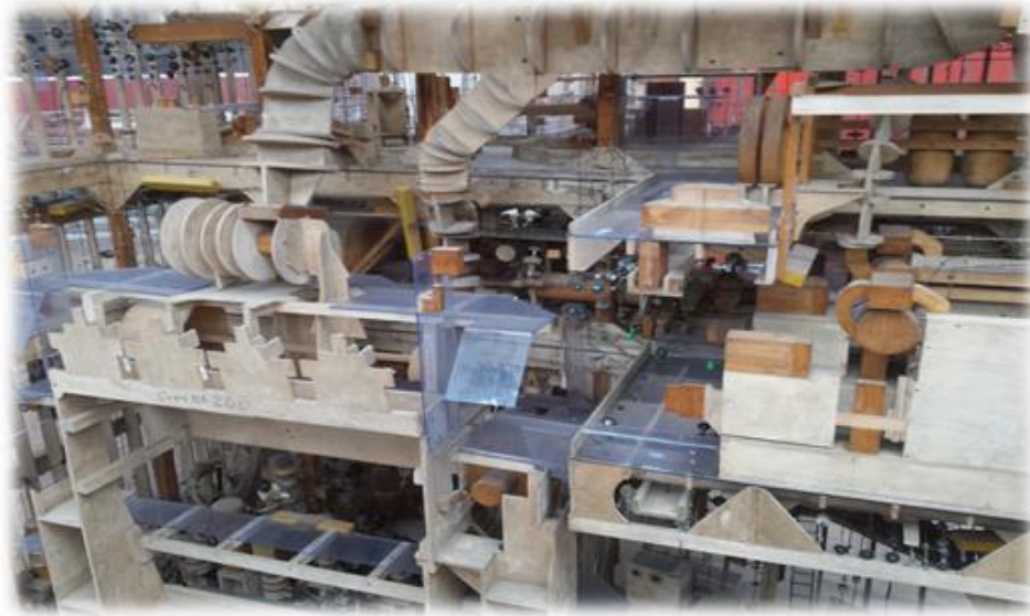
Figure 2. A scale ship model for manufacturing purposes.

in shipbuilding, demanding closer coordination between hull structure and outfitting, obliged marine suppliers to devote special attention to this matter. Some marine CAD tools started the development of particular outfitting tools, others limited tried to find a closer integration with existing plant design oriented systems. The development of the particular outfitting design tool was based on the fact that the actual requirements for outfitting design are not limited to a close integration with the structural design. Problems to be solved, regulations, working procedures, nomenclature, production information, etc. are so particular to ship design that it is convenient to have a dedicated tool rather than try to adapt an existing one. As time went by, outfitting tools have been increasing the scope of support.