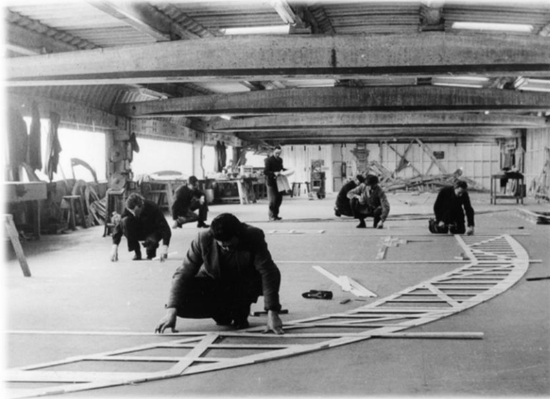
Figure 1. Old mould loft floor [7]

Drawings to define a ship hull became popular only in the XVII century in England [3]. The earliest existing mention of a spline, a wooden beam used to draw smooth curves, seems to be from the XVIII century. The birth of classical splines is believed to come from shipbuilding [4] and [5]. So probably, shipbuilding was the earliest industry to use constructive geometry to define free-form shapes. In the late XIX and early XX centuries the frames of a steel ship were stood up on the keel like those of a wooden ship, and the plates attached later. Frames had to be shaped to match the curves of the hull design. Each one was heated in a forge and then hammered or jacked to match the shape of its template. In late XIX century, it was not easy fairing the hull. Flexible sticks called battens , were used for fairing the lines, i.e. checking the measurements against the lofting and making sure they looked fair with no kinks or irregularities [6].